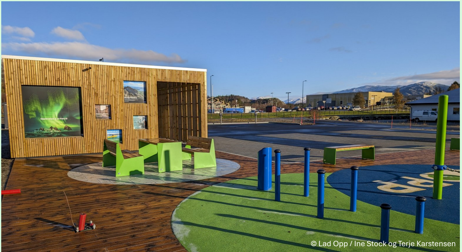
© Lad Opp / Ine Stock og Terje Karstensen